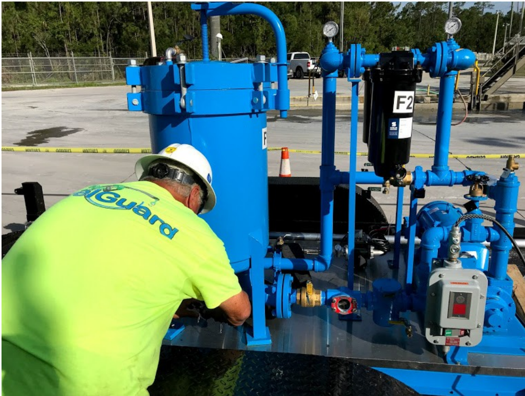
Hulk 2.0 unit, built in 2018. Electric explosion-proof motor operating a Blackmer vane pump. Cycles fuel from the tank through particulate filters (F1) and water filters (F2 and F3) and returns fuel to the other end of the tank in a continuous process until all contamination is removed. Operates at 50 gpm.