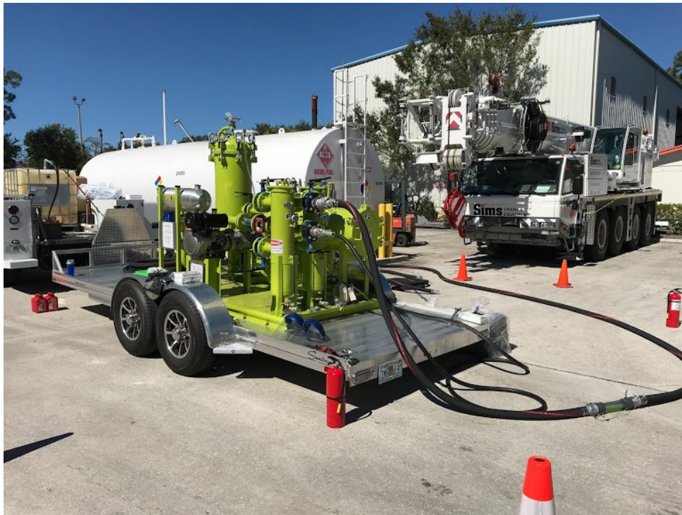
The Hulk. Continuously cycles fuel from the tank through particulate and water filters, returning fuel to the tank. Operates at 75-100 GPM

FuelGuard's fleet operates a variety of equipment 24/7/365 throughout the Guardian footprint.