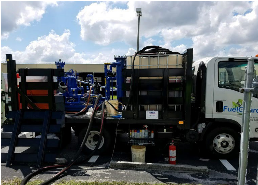
“Blue Bolt” Customized filtration equipment mounted on stake-body truck.